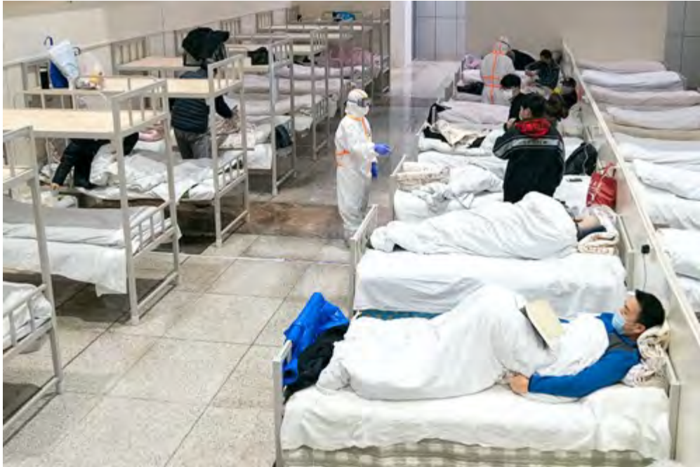
Patients infected with the novel coronavirus stay at a makeshift hospital converted from an exhibition center in Wuhan, central China's Hubei Province, February 5, 2020.

Reacting swiftly, the party's Central Committee authorized the National Supervisory Commission, the country's top anti-corruption body, to "thoroughly investigate."