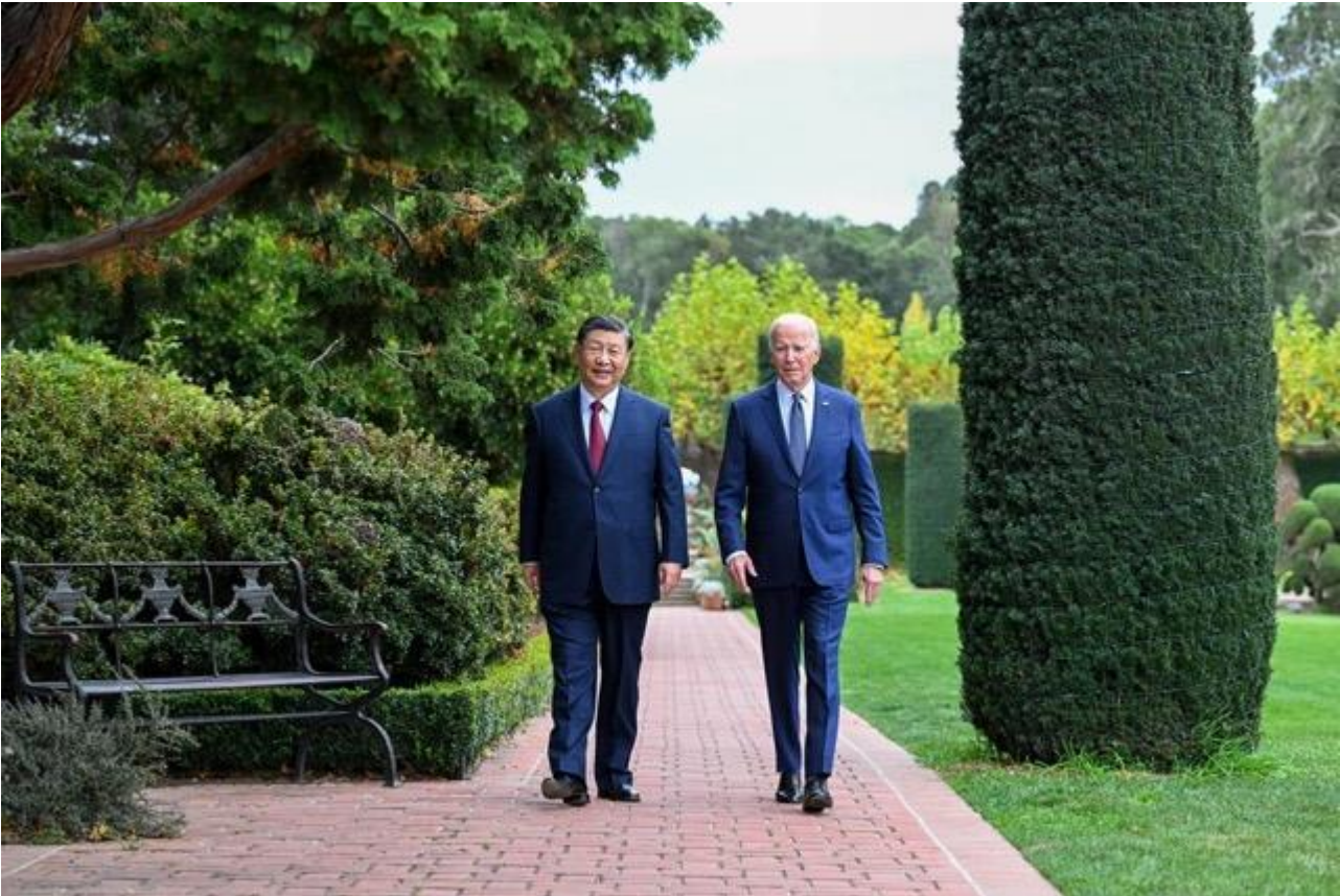
Chinese President Xi Jinping and U.S. President Joe Biden take a walk after their talks in Filoli Estate in the U.S. state of California, Nov. 15, 2023.