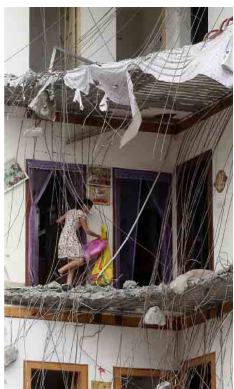
Thursday. A woman tries to make her way out of a partially collapsed building after an explosion caused by bombs hidden in parcels in Liucheng county, Guangxi (广西).