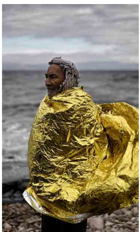
Wednesday. A man wrapped in a protective blanket watches from the beach as refugees arrive on the Greek island of Lesbos after crossing the Aegean sea from Turkey.