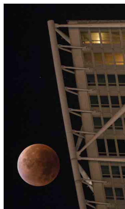
Monday. The "supermoon" appears behind the Turning Torso building in Malmo, Sweden. A swollen "supermoon" and total lunar eclipse combined for the first time in decades.