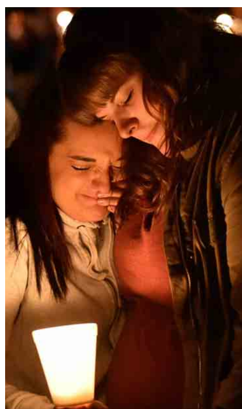
Friday. Residents mourn during a vigil in Roseburg, Oregon. Ten people were killed and seven wounded in a shooting at a community college in the western US state.