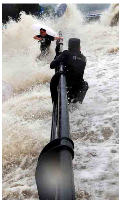
Tuesday. A paramilitary policeman and pedestrian hang on to a fence amid strong tidal waves under the influence of Typhoon Dujuan in Hangzhou (杭州), Zhejiang (浙江).